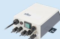
BASE IONIZER ES60